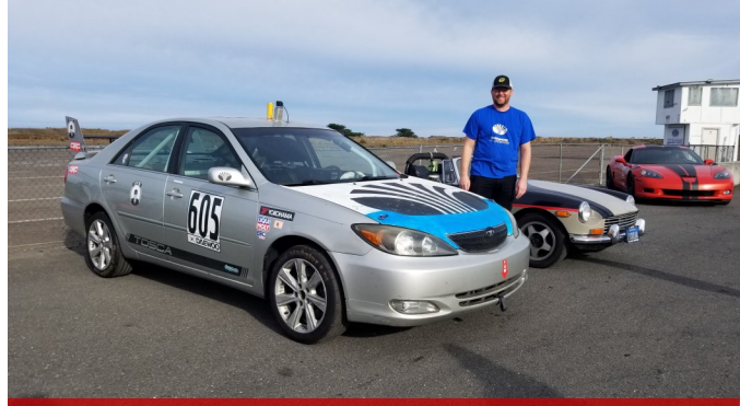
A classic Daewoo... Camry?