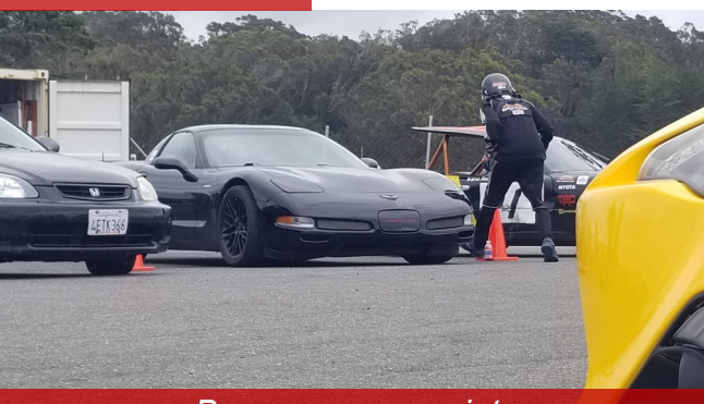
Be vewy vewy quiet...